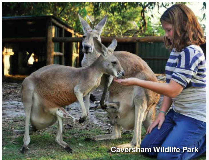
Caversham Wildlife Park