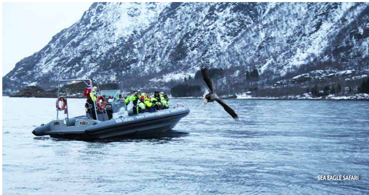
SEA EAGLE SAFARI

备注: · 行程以英文版本为主 · 行程顺序根据实际情况而变, 不提前另行通知 · 根据不可预测的情况, 欧美假期有权利改变行程, 并不提前另行通知 · 所有航班时间根据实际情况而变, 不提前另行通知